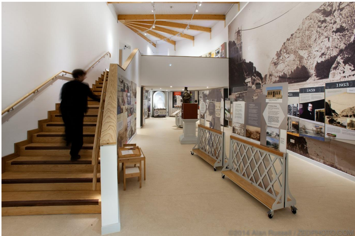
The exhibition space

The staircase is in two sections with a platform halfway up. The lower section is wide and narrows slightly as you climb. The upper section is two people wide. When climbing the stairs, the left handrail is in a straight line, parallel to the wall. The right handrail follows the shape of the stairs.