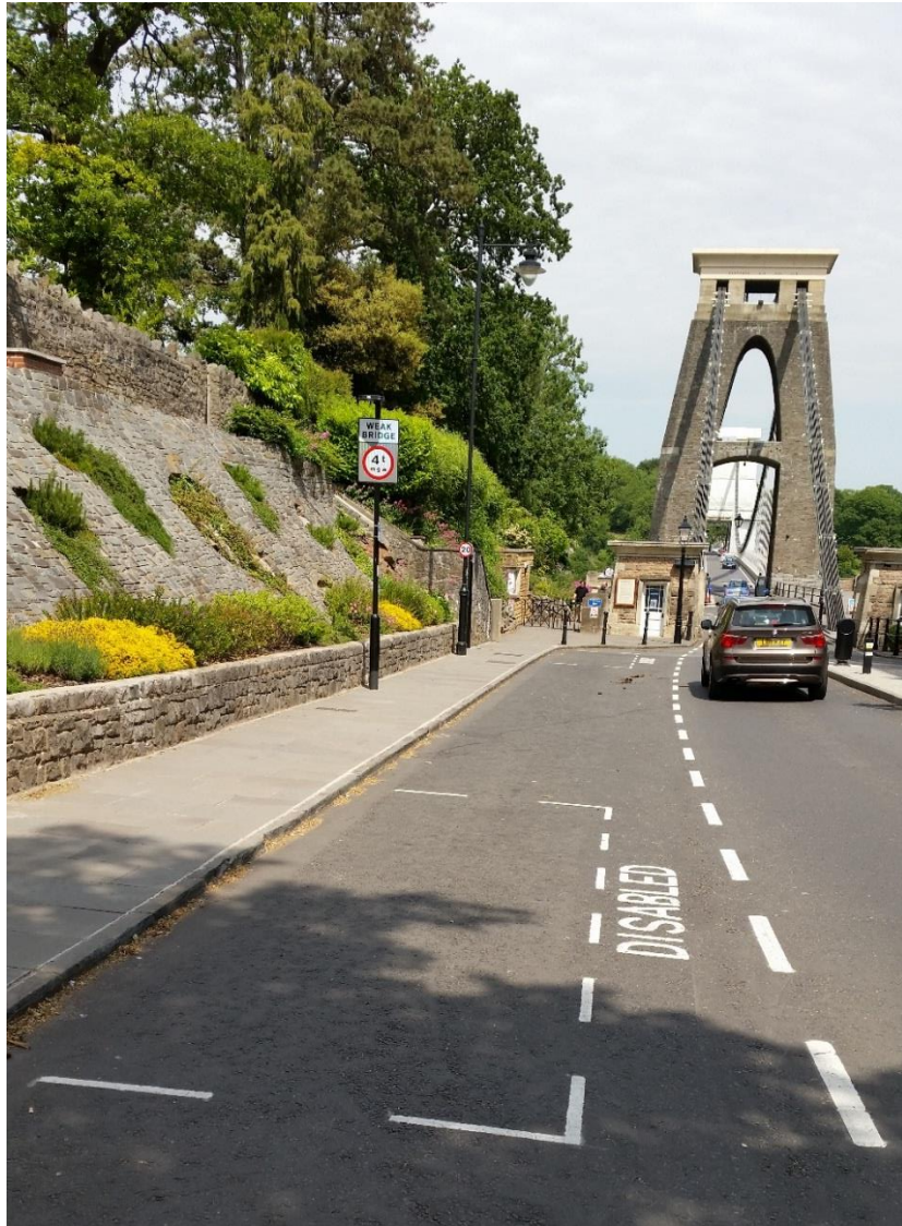
There are two parking bays for blue badge holders on the approach to the bridge and next to the Visitor Centre.