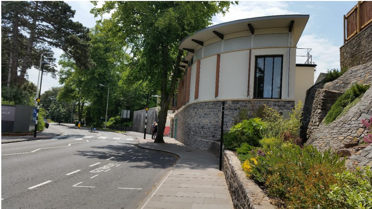
The Visitor Centre is located on Bridge Road, Leigh Woods, BS8 3PA

Clifton Suspension Bridge Visitor Centre is located in Leigh Woods, an area on the outskirts of Bristol located 15 minutes drive from the city centre. The Visitor Centre is on the side of the Avon Gorge, and Area of Outstanding Natural Beauty. Both Leigh Woods and Clifton Village (the adjoining area on the far side of Clifton Suspension Bridge) are hillside settlements. However, it is possible to park on either side of the Suspension Bridge and reach the Visitor Centre over flat terrain.