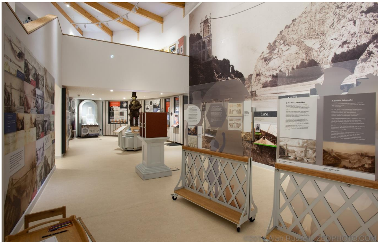
The ground floor exhibition and balcony

All of the information in our exhibition is in English.