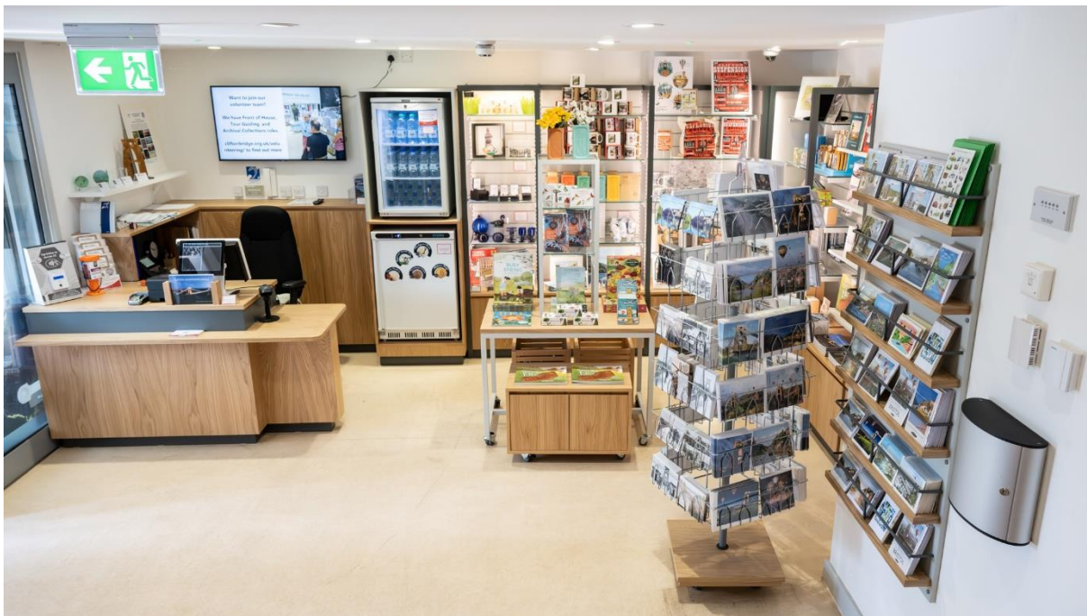
View of the Reception and Shop from the staircase. The entrance doors are to the left.

No ticket is required to visit the exhibition. You are welcome to move straight into the exhibition space. As soon as a member of the team is available, they will greet you and explain the content of the exhibition.